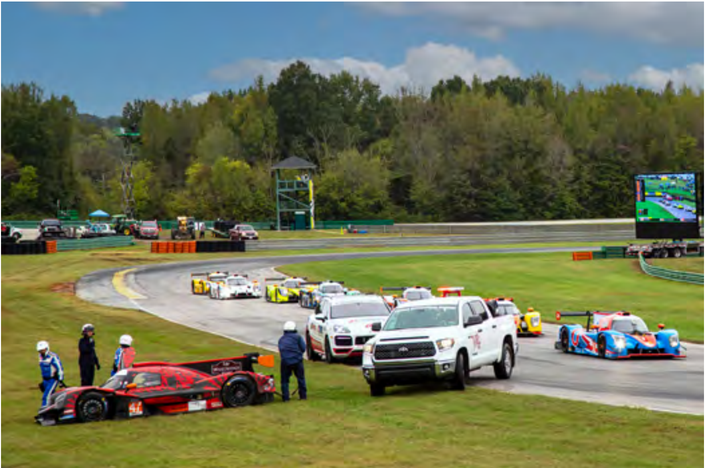
FLASHBACK 2022: Full course caution at Virginia International Raceway. The Porsche Corral/Porscheplatz is a favorite event for Blue Ridge Region members. Usually there are 100+ Porsches there. Parade laps are a favorite,