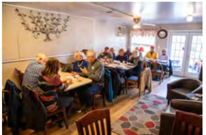
Members eat and talk in a friendly atmosphere. We look forward to being at this location.

Your editor is a frequent guest, and is glad our members also enjoy eating there. Blue Ridge Region members support locally owned businesses.