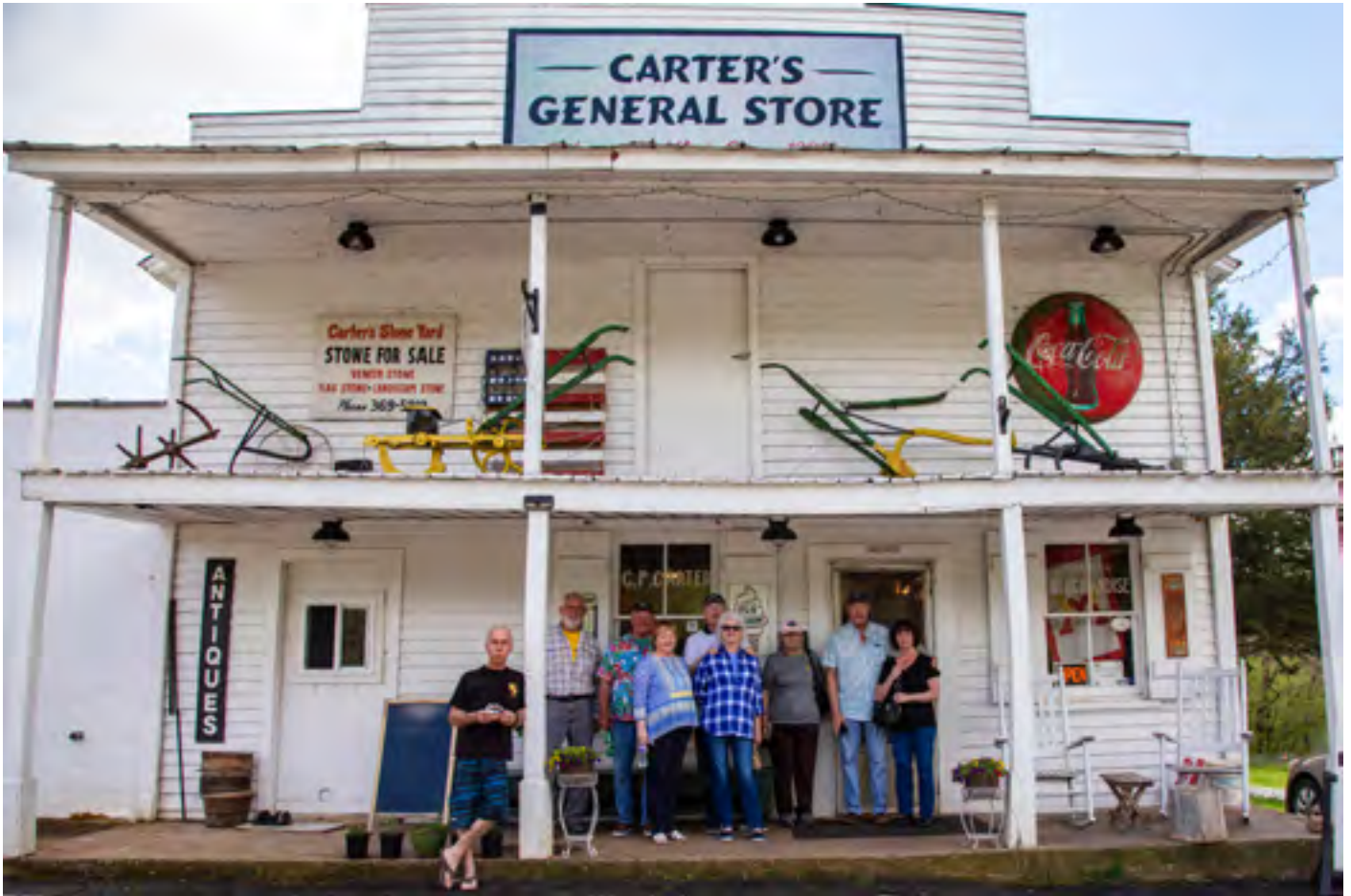
Blue Ridge Region members who decided to stop at Carter's General Store on the way home from Cars 'n Coffee in Moneta posed for a group photo before continuing home.