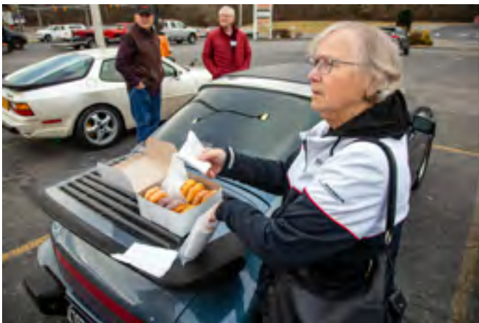
Don't those doughnuts look scrumptious?

Winter was warmer than usual allowing for a January Cars 'n Coffee at Famous Anthony's in Roanoke. Members were glad to be able to have a January event as the weather is usually too unpredictable. While it was a little too cold for the usual parking lot socializing, it was warm enough for doughnuts before brunch. Many people like to start a meal with dessert.