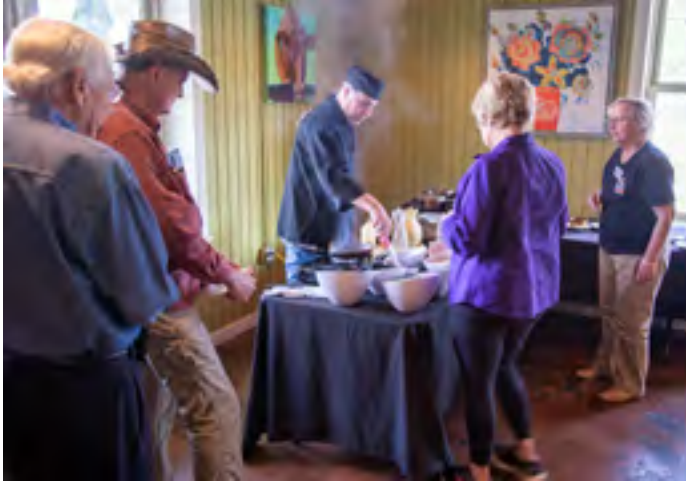
Blue Ridge Region members wait for their freshly prepared omelet before planning began.

Each year we have a planning session to begin our calendar of events. This year we met at The Green Goat for brunch before the planning session began. Several great ideas were selected and planning them began.