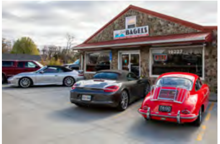
Members starting to arrive for the March Cars 'n Coffee. We look forward to being at this location.

One of our favorite stops is Blue Ridge Bagels in Lynchburg, VA. Locally owned and operated, it serves New York bagels with various toppings, and sub sandwiches. The large parking lot offers members plenty of room to socialize before eating. Customers were surprised and thrilled to see the Porsches there, and many spent time looking over the cars and taking pictures.