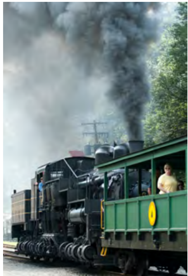
FLASHBACK 2010: We visited the Cass Scenic Railroad in Cass, WV.