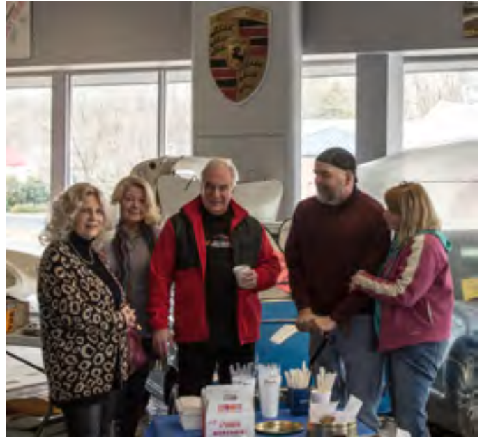
FLASHBACK 2015: Planning session at Martin's German Service in Roanoke, VA.

NOTE: Most of our events require registration as many places limit attendees. Attendance is limited to members, their family, and invited guests. We use MotorsportReg.com to register for our events.