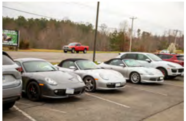
Four member cars at Old Oak Cafe. The earlier rain sprinkles went away so everyone had a dry drive home. Unfortunately, it was a little too cool to have the top down.