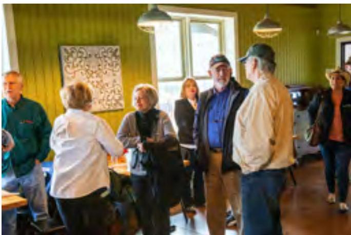
Inside the restaurant, the smells of food made everyone ready to eat.