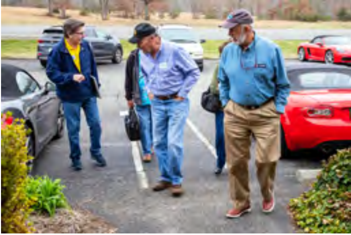
It is time to eat. Better hurry so we can talk more before the food arrives.