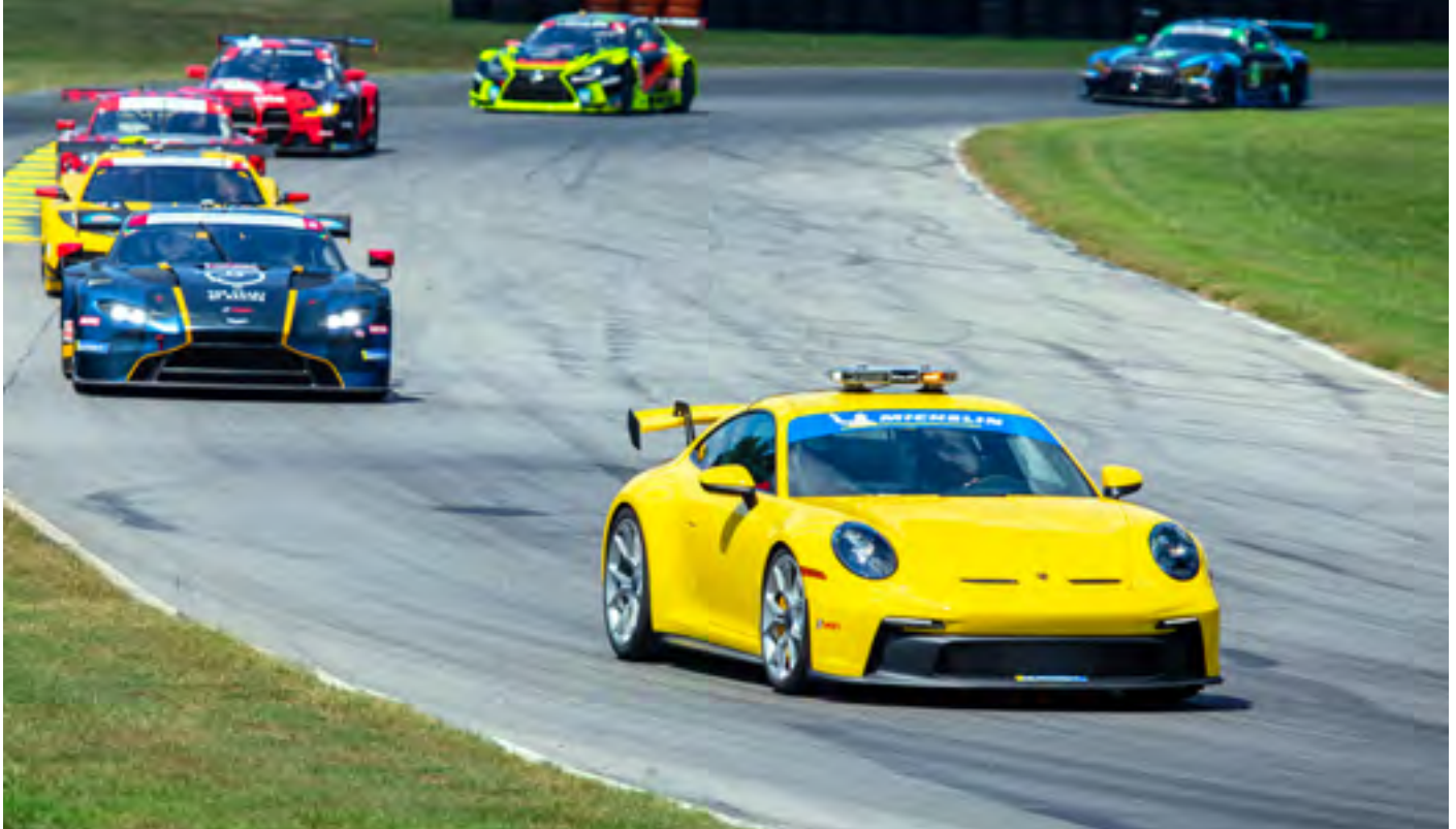
The Porsche pace car leads the pack on the warm-up laps before the start of the Michelin GT Challenge.