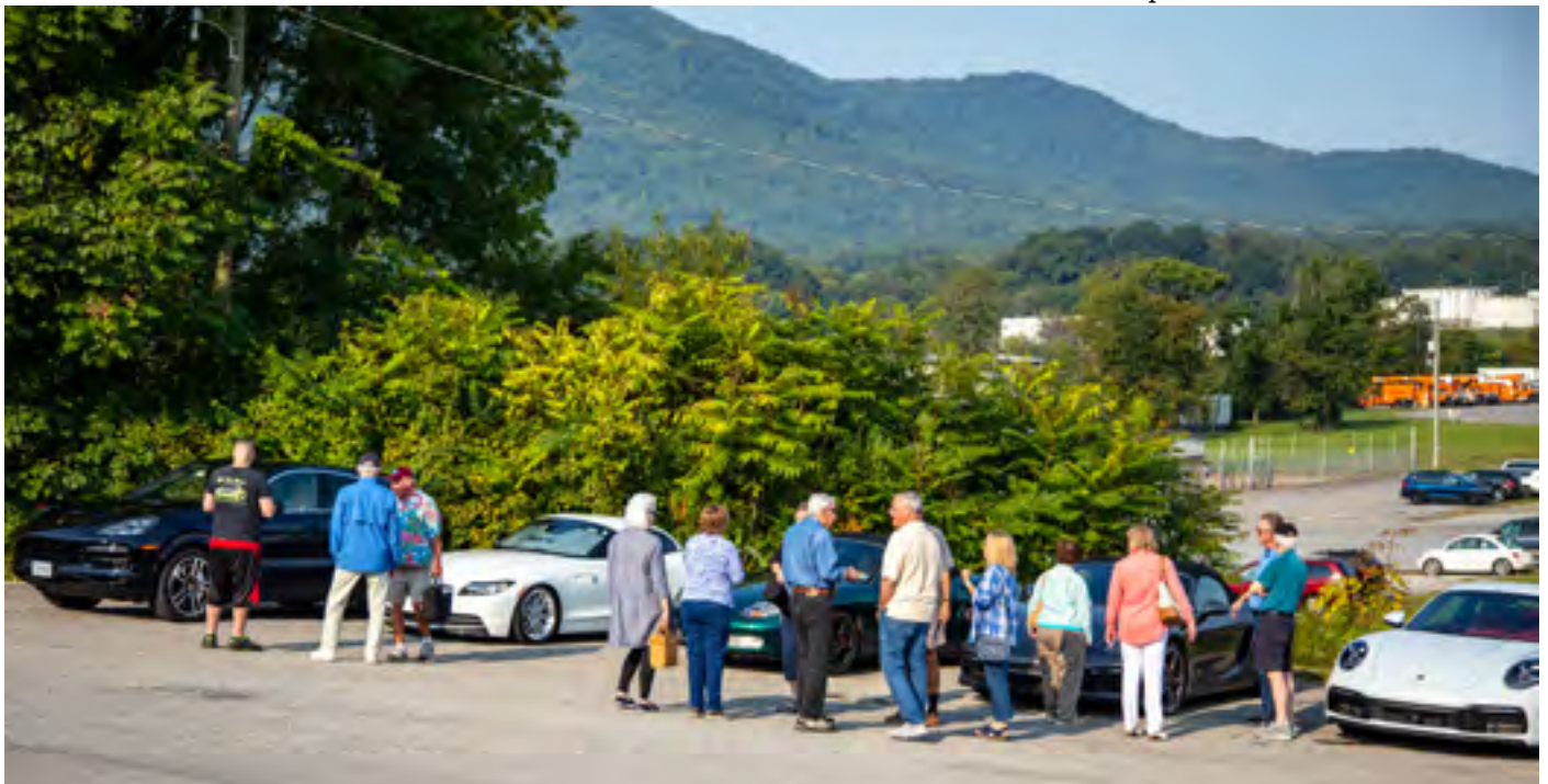
Porsche talk in the parking lot before brunch is an every event happening, weather permitting.