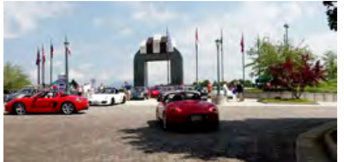
Porsches arriving at The National D-Day Memorial in Bedford, Virginia.