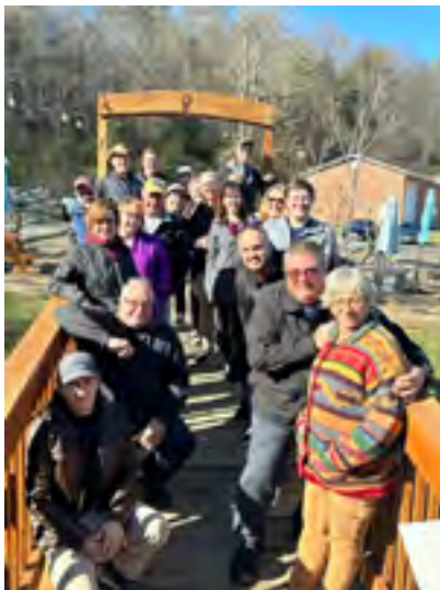
Rally participants braved the cold temperatures and posed for a group photograph.

Below their cars wait silently for the drive home, free of in-car disagreements.