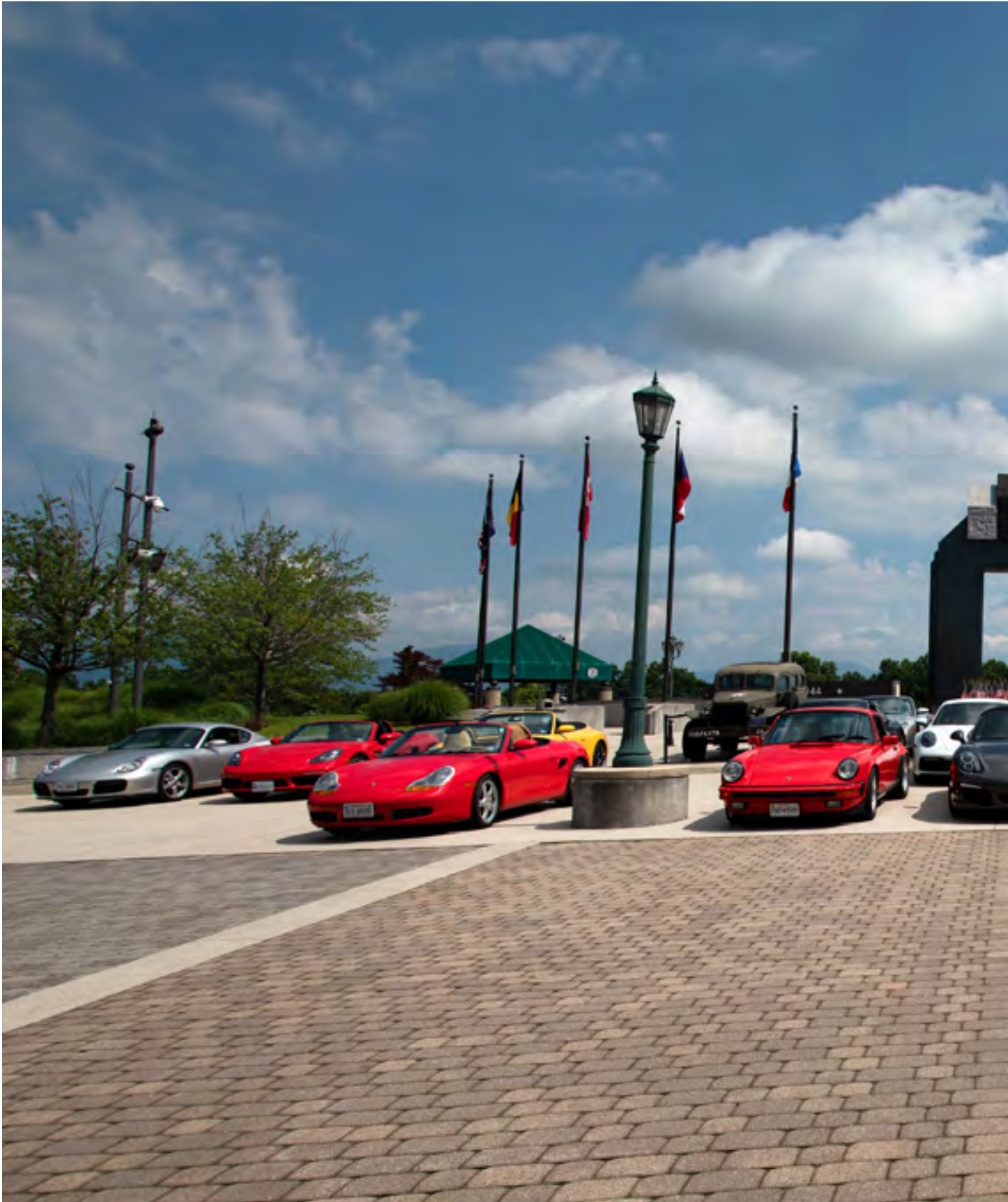
Member Porsches at The National D-Day Memorial in Bedford, Virginia