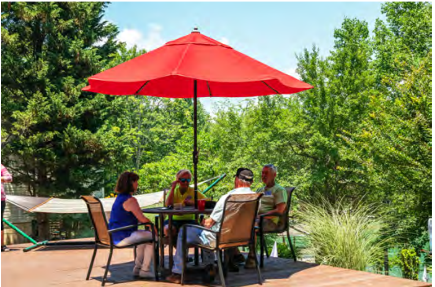
After the drive and collection viewing are over, it is time to relax in the shade and wait for lunch.