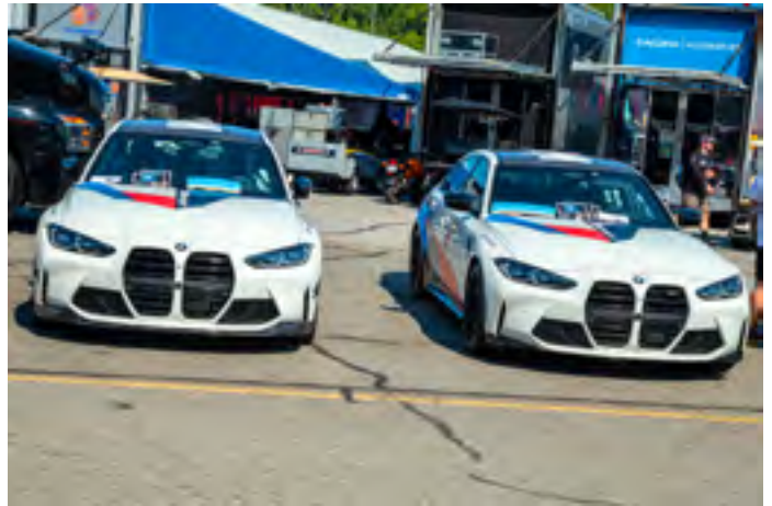
How much is that BMW in the paddock?