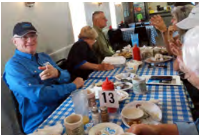
One of our tables, full of Blue Ridge Region members.