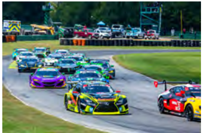
GTD cars at the start of the race. There are Porsche, Mercedes, Acura, Lexus, Corvette, and others. There are many cars racing close together.