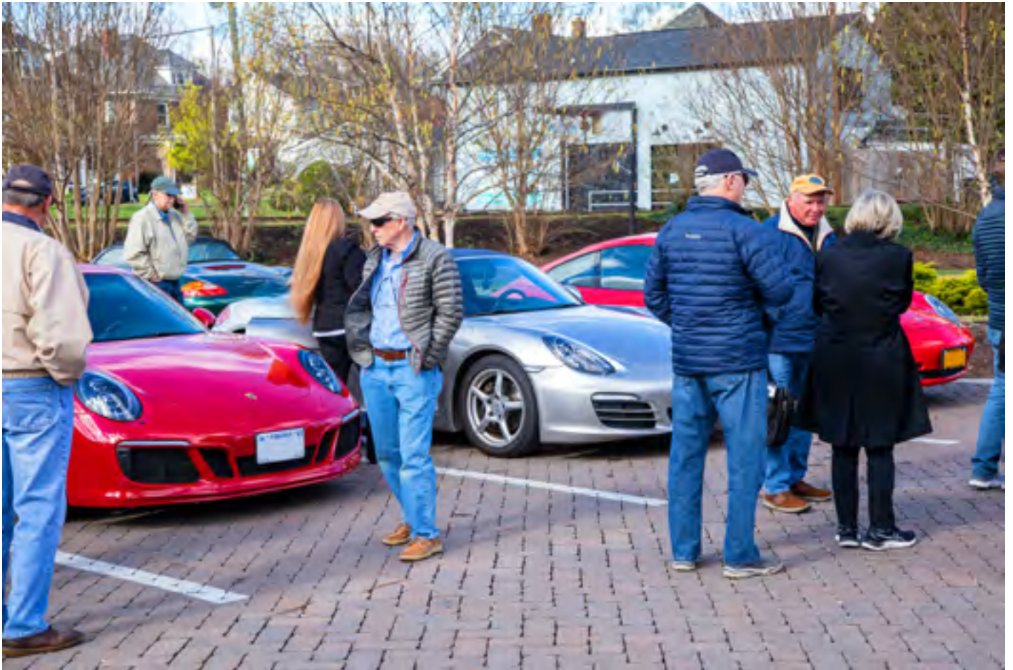
In the parking lot at The Green Goat, members looked at the various Porsches and greeted friends. Old friends and new friends enjoyed the warmth of being together again.

The socializing moved inside until the brunch bell rang. After opening announcements, the buffet started. Breakfast foods were abundant, omelets were custom made, and fresh fruit was plentiful. It was a very enjoyable event for everyone.