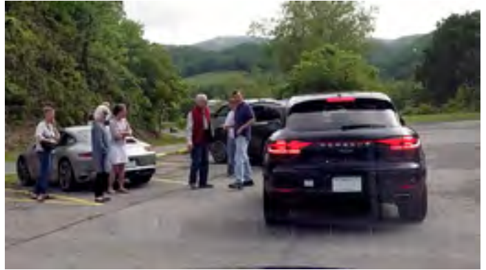
Arriving at Hale's Restaurant to see several Porsches already there.

The morning was partly cloudy as we began the drive to Hale's Restaurant in Shawsville, VA for brunch. Fortunately, the rain showers held off so we could enjoy the usual parking lot socializing. The Lynchburg area group first stopped to pick up the Snowman who now has a new living arrangement.