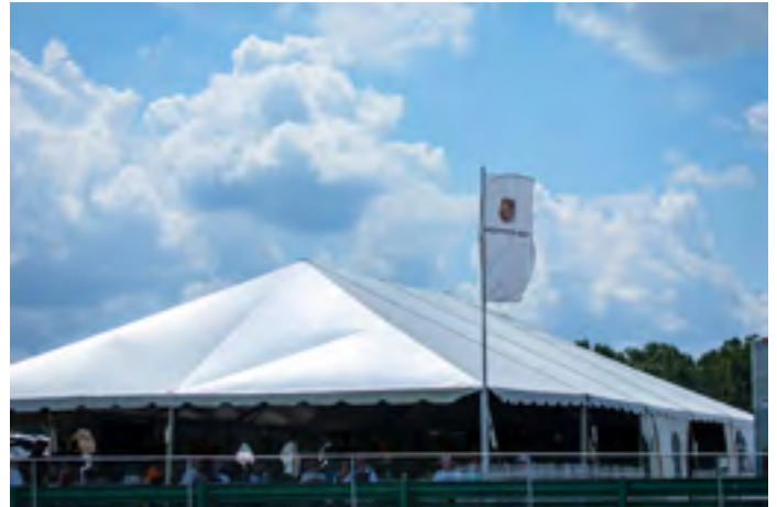
View of the Hospitality Tent from track-side.

It was a very interesting and busy weekend. Let's do it again next year.