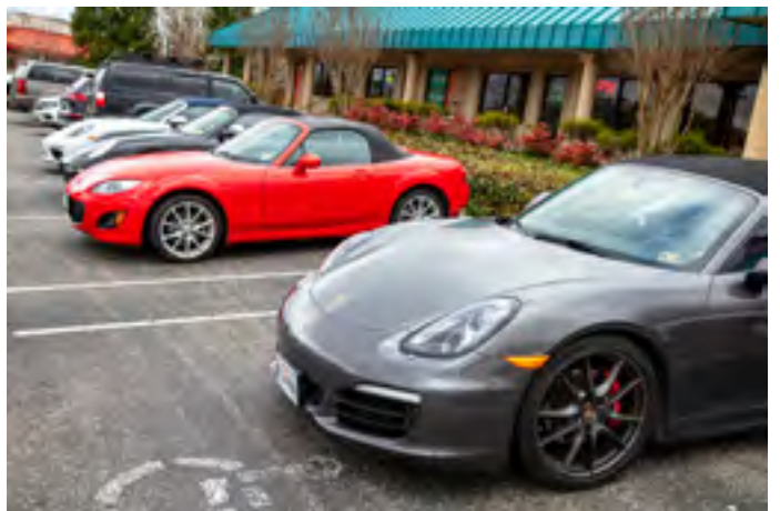
One member thought it was OK to drive a Miata to a Porsche event. He is now on probation.