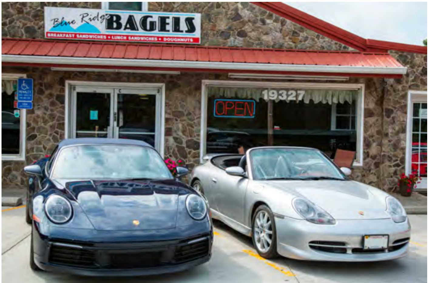
What a difference 20 years makes. Left is a 2020 cabriolet and right is a 2000 cabriolet.

Your editor is a frequent guest there, and is glad our members also enjoy eating there. Blue Ridge Region members support locally owned businesses.