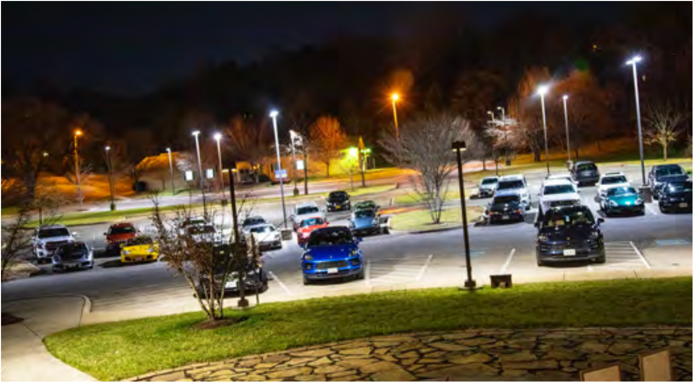
Night at the Vinton War Memorial as our Porsches wait for their passengers and the drive home.