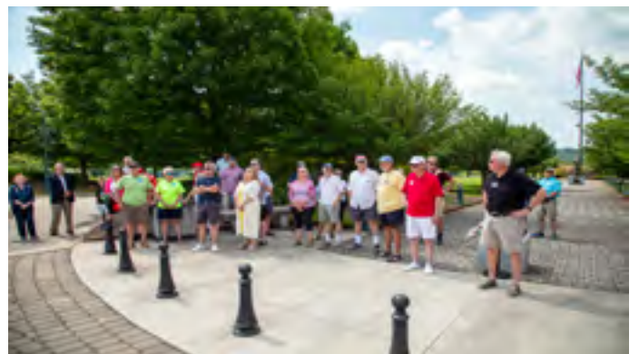
Blue Ridge Region Members at The National D-Day memorial for the donation presentation to the Bedford Boys Tribute Center.