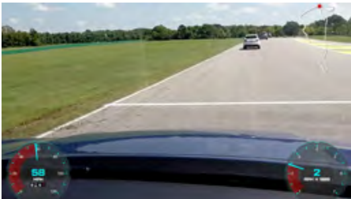
Start/Finish line at Virginia International Raceway.

One of the highly anticipated events is the Parade Laps. Driving on the track at low speeds allows the driver and passenger a chance to experience being on a real racetrack and do a little sightseeing from a different perspective. Each year there is no shortage of participants. Some have dash cameras, others have a passenger with a camera.