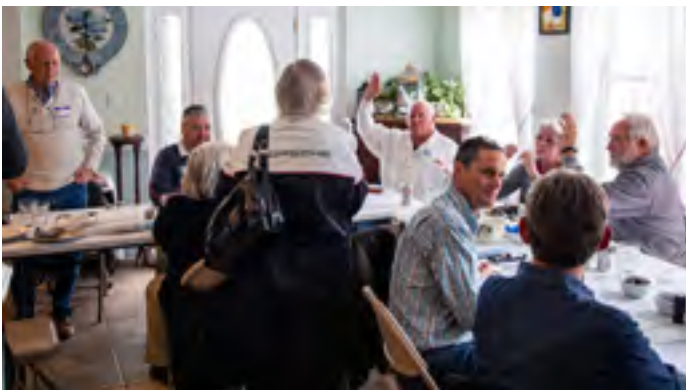
Our friendly group enjoyed the food and company.