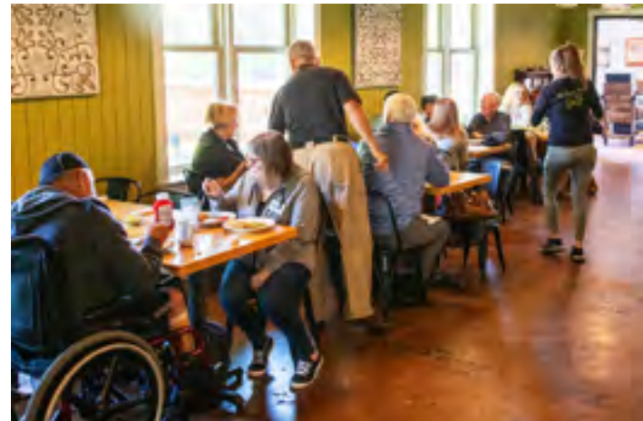
There was plenty for everyone to eat, and the atmosphere was very pleasant.