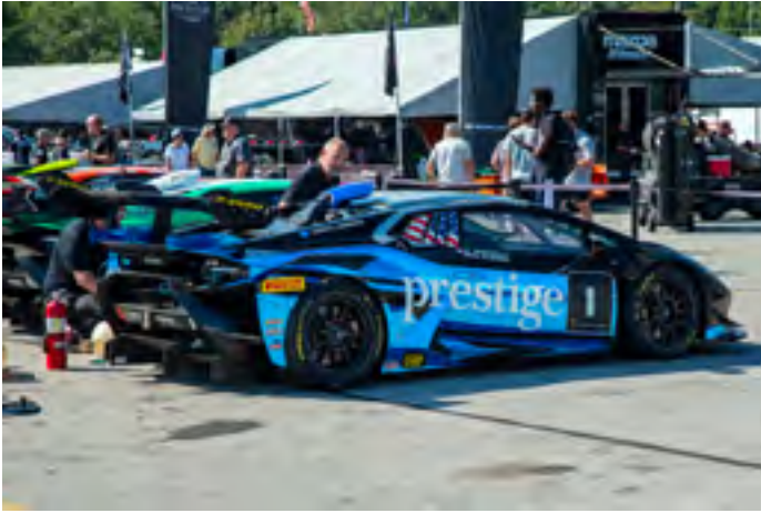
A Lamborghini Trofeo is ready and waiting to go.