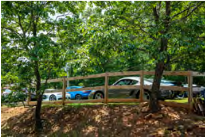
Our very own Porsche Corral