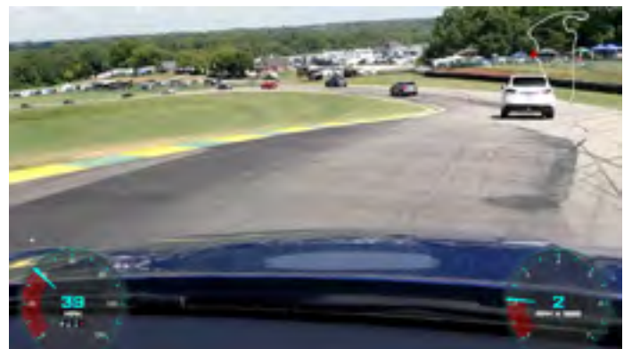
Roller Coaster at Virginia International Raceway.

One of the highly anticipated events is the Parade Laps. Driving on the track at low speeds allows the driver and passenger a chance to experience being on a real racetrack and do a little sightseeing from a different perspective. Each year there is no shortage of participants. Some have dash cameras, others have a passenger with a camera.