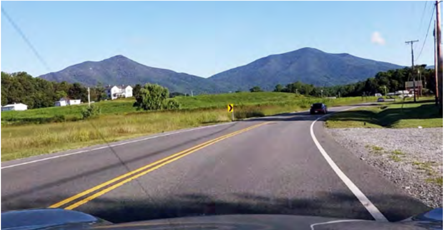
Driving west we can see our destination, Sharp Top, and it's neighbor Flat Top about 10 miles away.