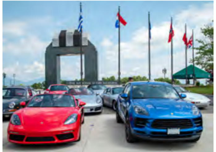
This Macan was only "grocery getter" in the group.