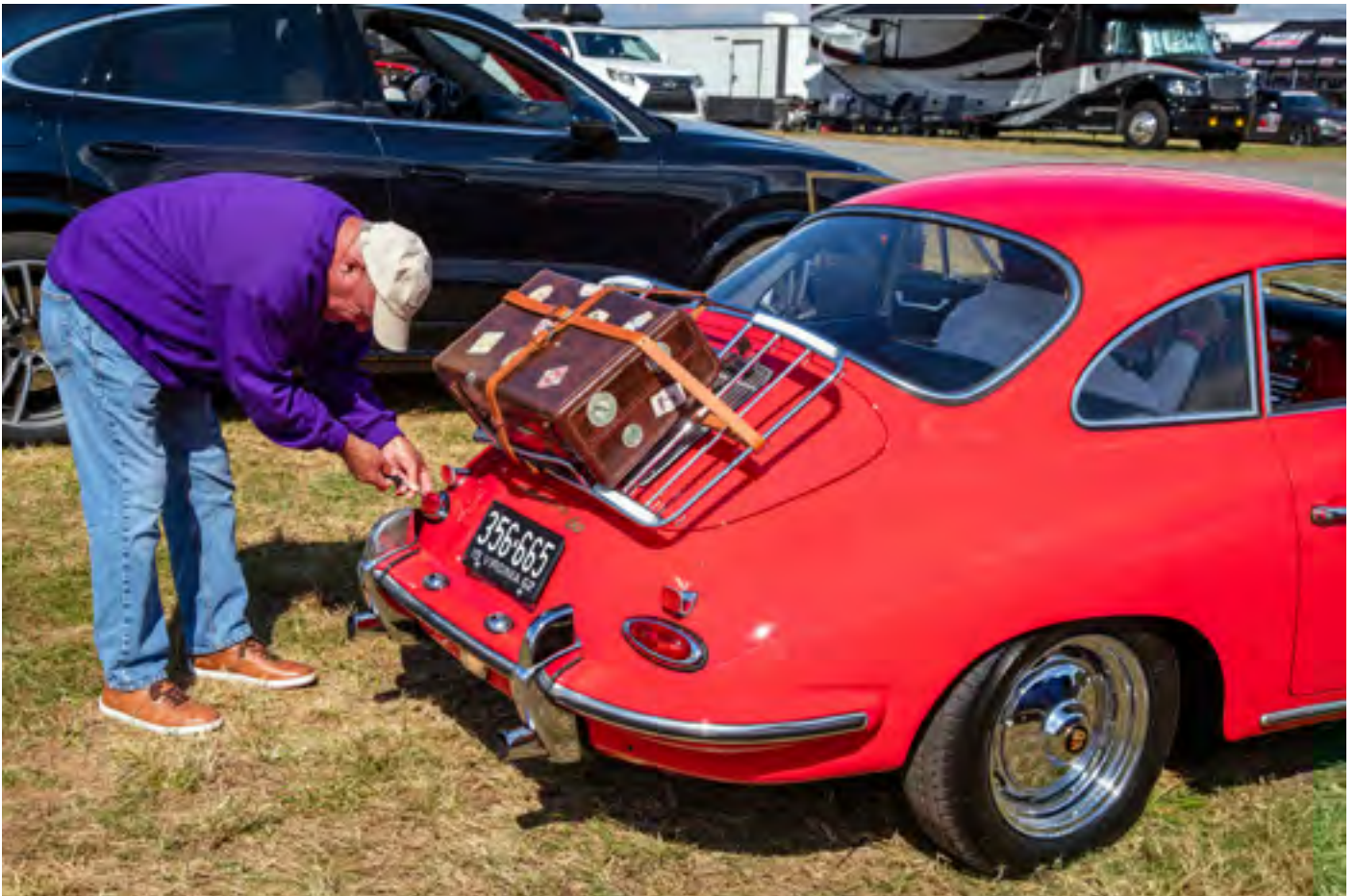
It is interesting to know a 2020 Macan screwdriver works on a 1962 356.