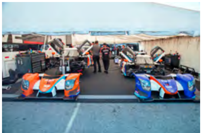
Prototype Challenge cars being prepared for their next event. Lots of work is taking place.