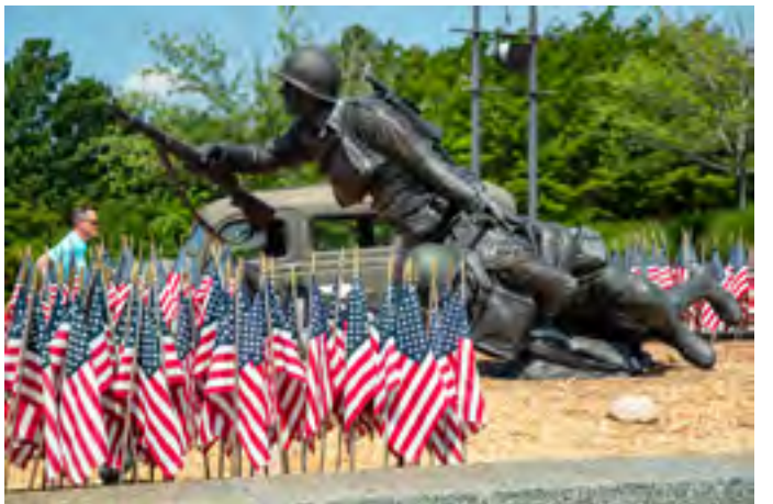
One of the many statues at The National D-Day Memorial in Bedford, Virginia.