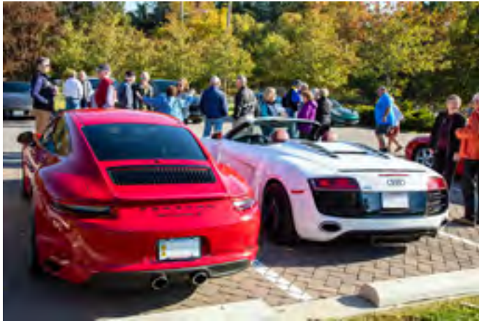
The weather was perfect for socializing before brunch. Checking the Audi R8 was part of the fun.

The day was fall perfect, sunny and unseasonably warm, as we drove to The Green Goat in Roanoke, VA for brunch. The weather was perfect for the usual parking lot socializing. Only the lure of good food and friendly people could lead us inside.