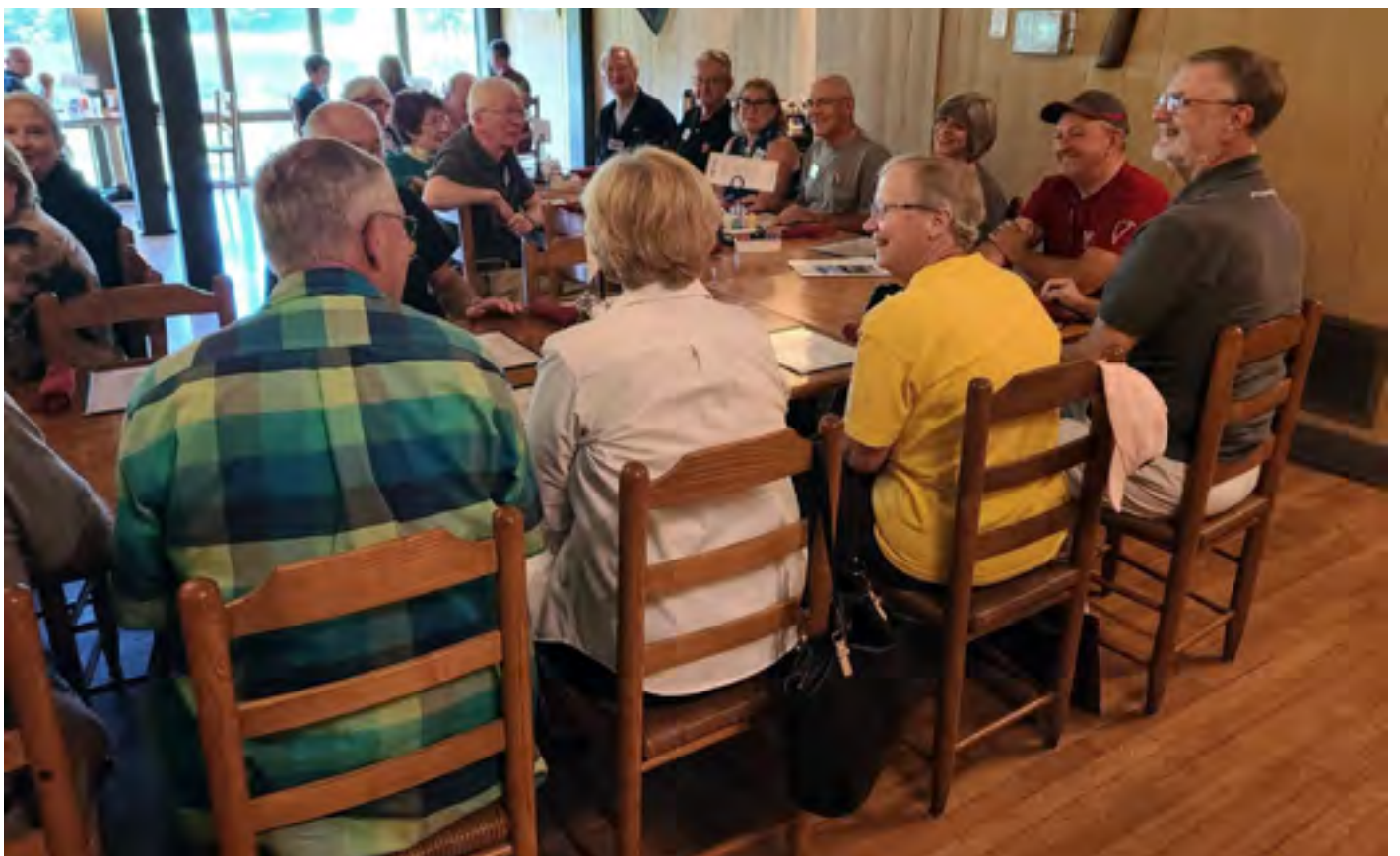
In the restaurant, friends enjoying conversation before the food arrives at Peaks of Otter Lodge.