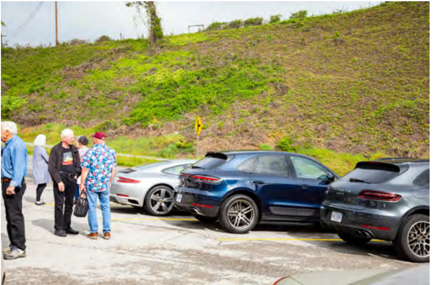
Before going inside to eat, members looked at the Porsches in the lot and renewed friendships. The number of Porsche SUVs increases each year.

The atmosphere at Hale's Restaurant was festive and lively. As always, the food was delicious and the people friendly. Members look forward to each visit. The drive there was a big part of the fun. After the event ended, some members continued to Christiansburg to visit Duncan Imports and Classics where there are over 700 cars to view and possibly purchase.