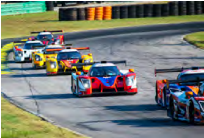
Prototype Challenge cars on their pace laps prior to the Prototype Challenge race.

What type of racing do you like? If it is sports cars, Virginia International Raceway is the place to be in August. With most major brands participating, every sports car lover should have an opportunity to see a favorite make in action. With the Prototype cars race added, there is even more interesting racing to be seen.