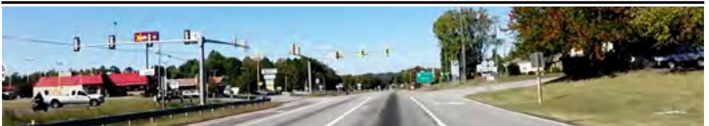
Yes Virginia, there really is a Tightsqueeze, Virginia in the Blue Ridge Region.