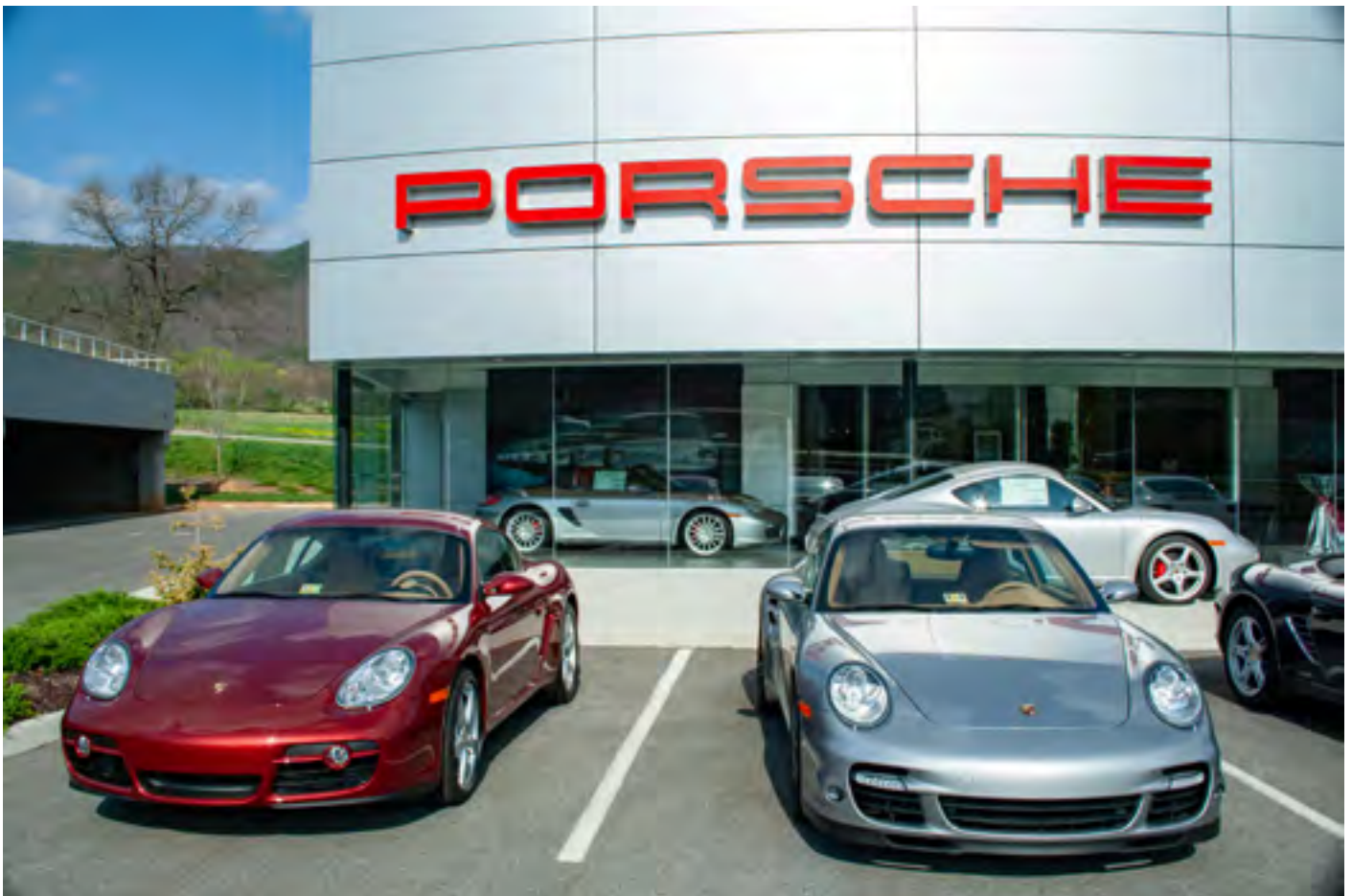
Porsche of Roanoke was very new in this 2008 photograph.