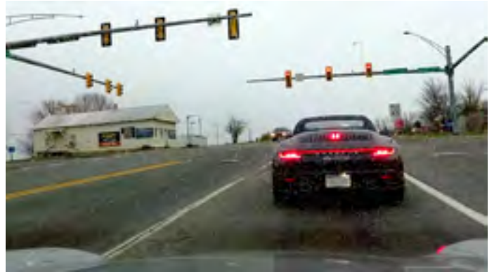
On the way, the Lynchburg area group proved Porsches do not melt in the rain.

Our next Cars 'n Coffee last year was in March at Old Oak Cafe in Moneta, VA. This location is always a favorite for Blue Ridge Region members.