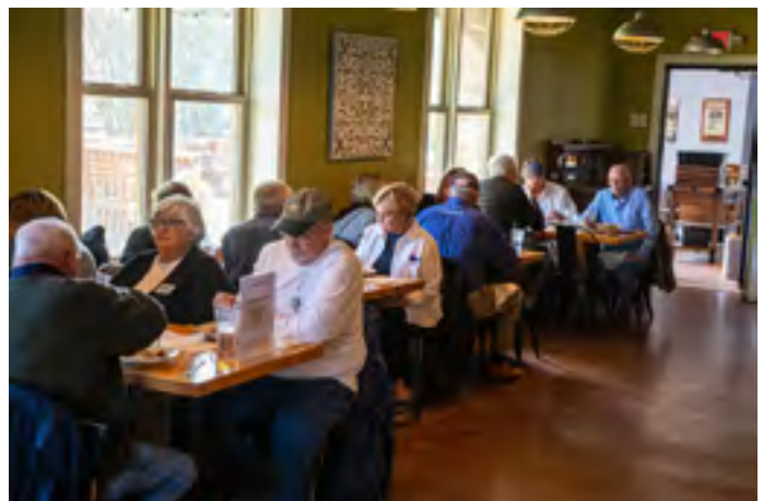
The buffet had something for everyone. It was obvious everyone was enjoying the food and drink.