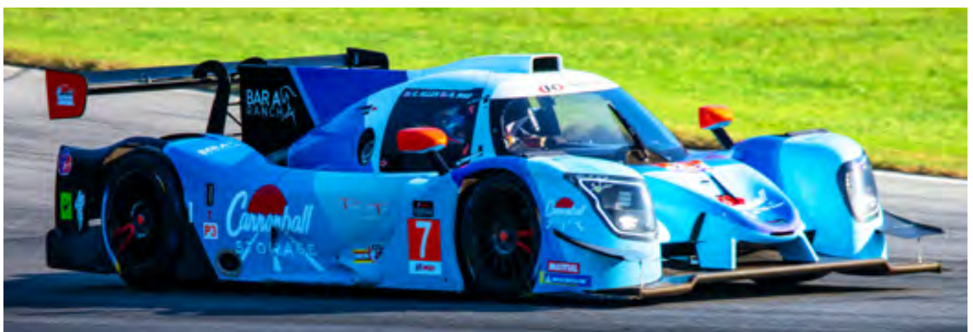
A Prototype Challenge car during morning practice. Fighting the direct sunlight must have been a challenge.