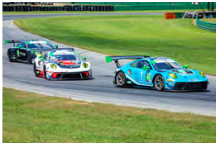
GT Daytona Porsches at the start of the race. The blue #16 Wright Motorsports Porsche GT3 R finished 5th in class, the #99 Team Hardpoint Porsche GT3 R finished 10th in class.

Even the parking area is worthy of a visit. Porsche, BMW, and Corvette have corrals, making a walk through the corral almost mandatory. Many vintage cars are scattered around the parking areas. Sunday's Open Grid/Fan Walk allows spectators to walk along pit road with cars and drivers there for driver autographs and photos.