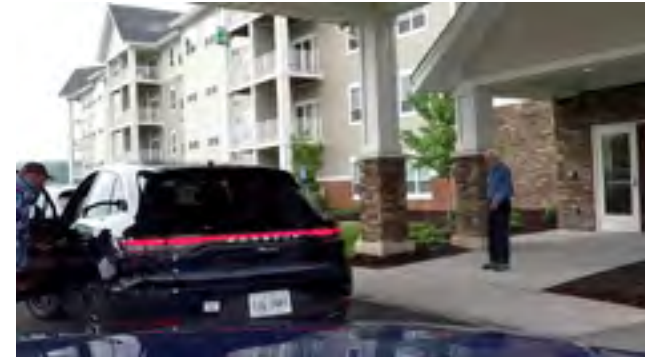
Our first stop was to pick up the Snowman at his new living quarters.

The atmosphere at Hale's Restaurant was festive and lively. As always, the food was delicious and the people friendly. Members look forward to each visit. The drive there was a big part of the fun. After the event ended, some members continued to Christiansburg to visit Duncan Imports and Classics where there are over 700 cars to view and possibly purchase.