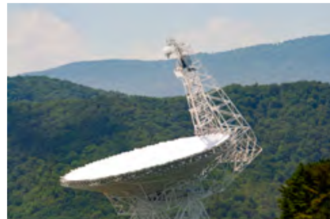
Greenbank Observatory , Greenbank, WV. 2010