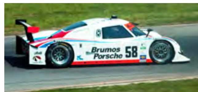
Brumos Porsche #58 at Virginia International Raceway . 2009