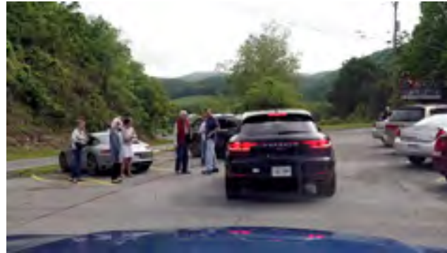
Arriving at Hale's Restaurant to see several Porsches already there.

The morning was partly cloudy as we began the drive to Hale's Restaurant in Shawsville, VA for brunch. Fortunately, the rain showers held off so we could enjoy the usual parking lot socializing. The Lynchburg area group first stopped to pick up the Snowman who now has a new living arrangement.