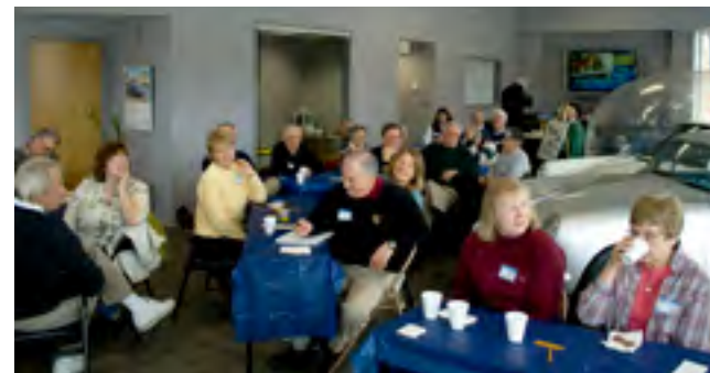
Planning session at Martin's German Service . 2008