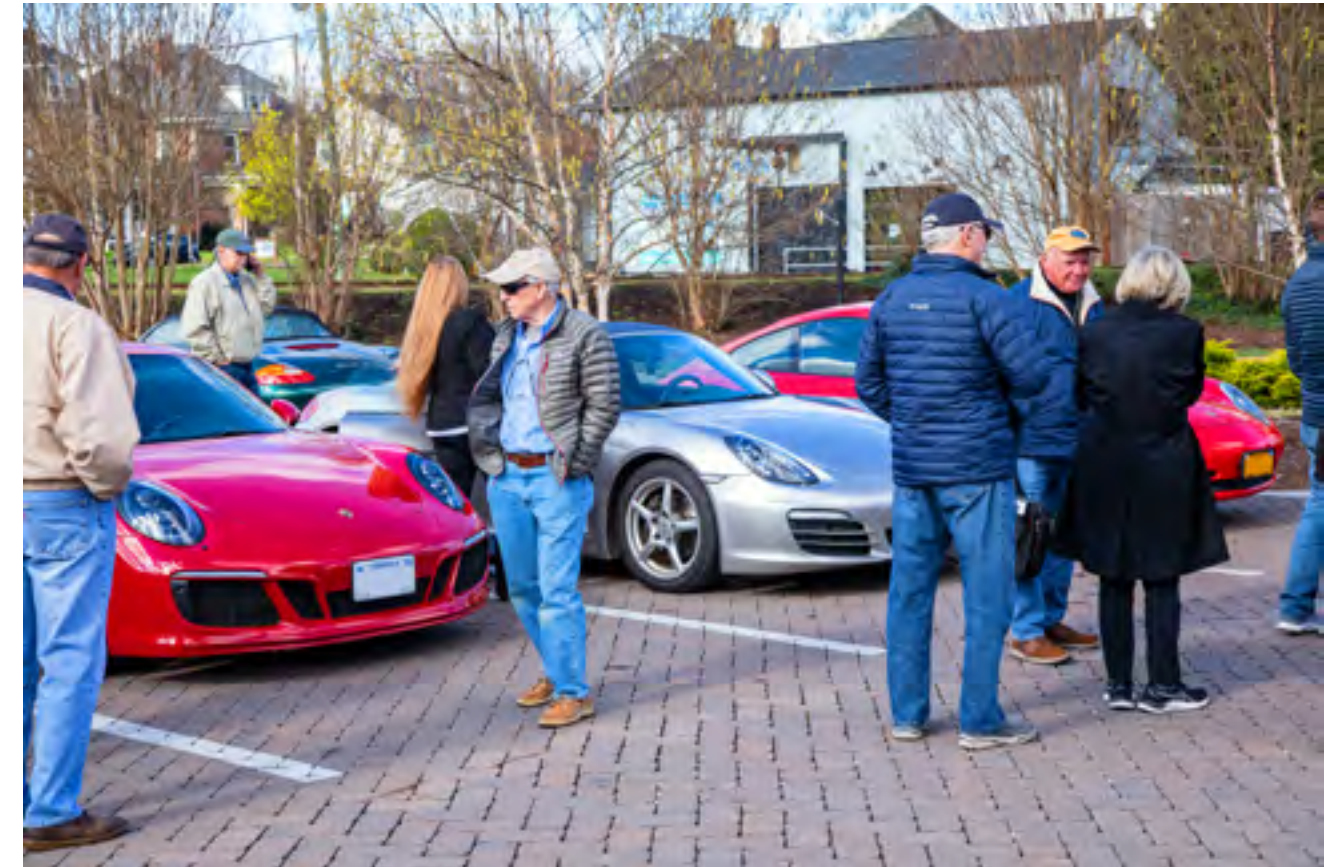
In the parking lot at The Green Goat, members looked at the various Porsches and greeted friends. Old friends and new friends enjoyed the warmth of being together again.

The socializing moved inside until the brunch bell rang. After opening announcements, the buffet started. Breakfast foods were abundant, omelets were custom made, and fresh fruit was plentiful. It was a very enjoyable event for everyone.