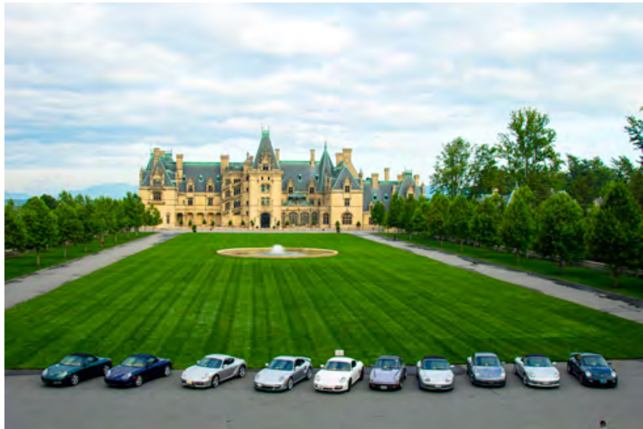
Blue Ridge Region at the Biltmore Estate, 2012