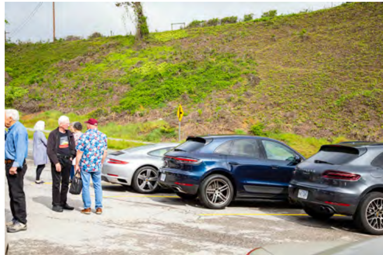
Before going inside to eat, members looked at the Porsches in the lot and renewed friendships. The number of Porsche SUVs increases each year.

The atmosphere at Hale's Restaurant was festive and lively. As always, the food was delicious and the people friendly. Members look forward to each visit. The drive there was a big part of the fun. After the event ended, some members continued to Christiansburg to visit Duncan Imports and Classics where there are over 700 cars to view and possibly purchase.