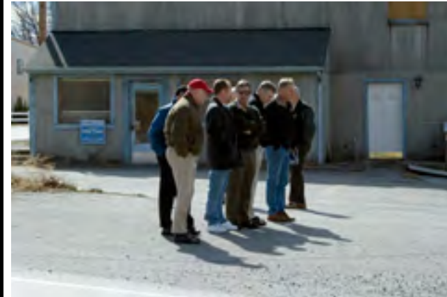
Only Porsche fanatics would stand in the February cold during a photo session. 2008