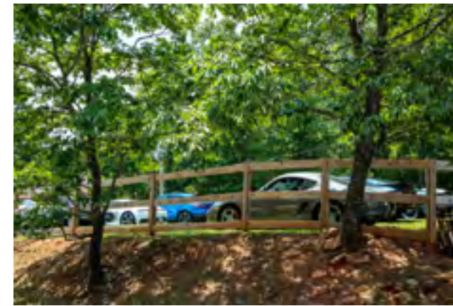
Our very own Porsche Corral