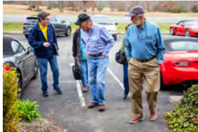
It is time to eat. Better hurry so we can talk more before the food arrives.