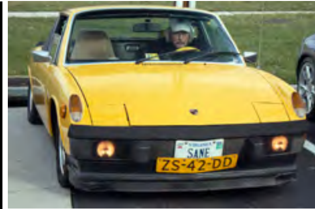
We have heard this man is in-sane. 2011