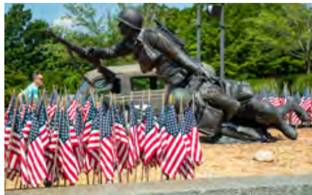
One of the many statues at The National D-Day Memorial in Bedford, Virginia.