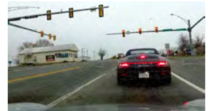
On the way, the Lynchburg area group proved Porsches do not melt in the rain.

Our next Cars 'n Coffee this year was in March at Old Oak Cafe in Moneta, VA. This location is always a favorite for Blue Ridge Region members.