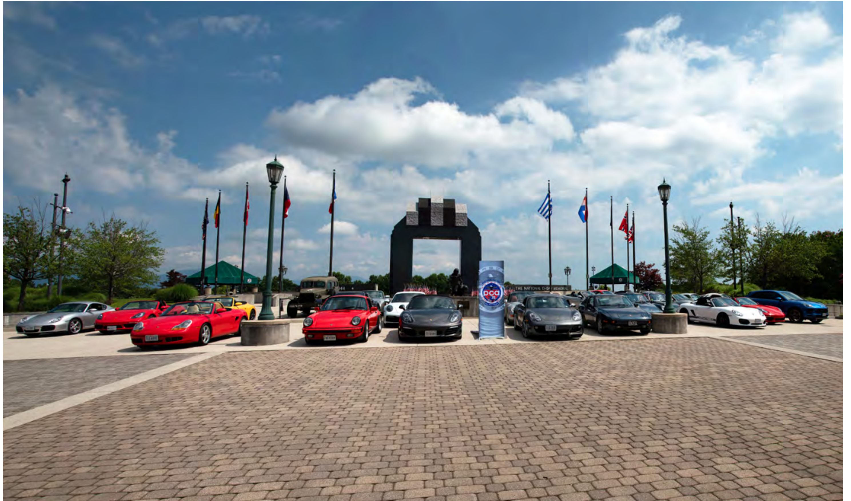
Member Porsches at The National D-Day Memorial in Bedford, Virginia