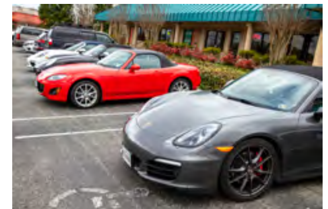
One member thought it was OK to drive a Miata to a Porsche event. He is now on probation.