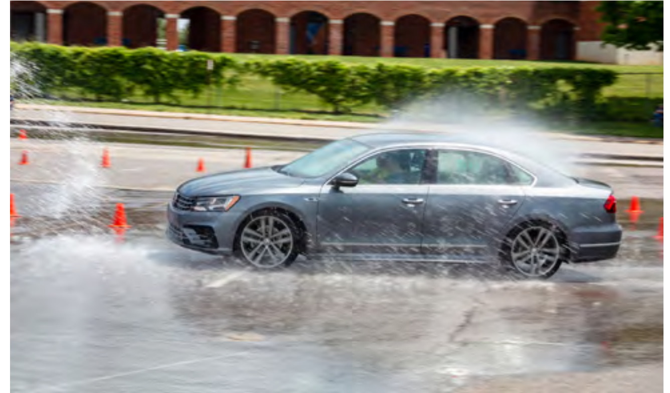
A young driver learns how to handle the car in driving rain and on wet roads during Street Survival. 2018