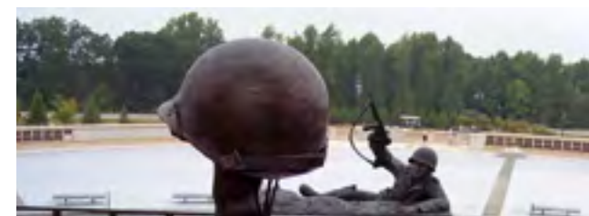
Our visit to The National D-Day Memorial in 2005