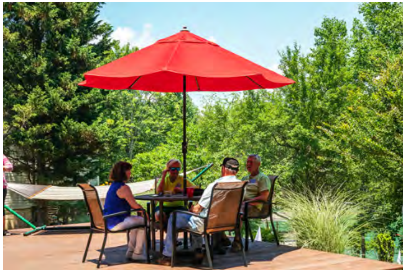
After the drive and collection viewing are over, it is time to relax in the shade and wait for lunch.