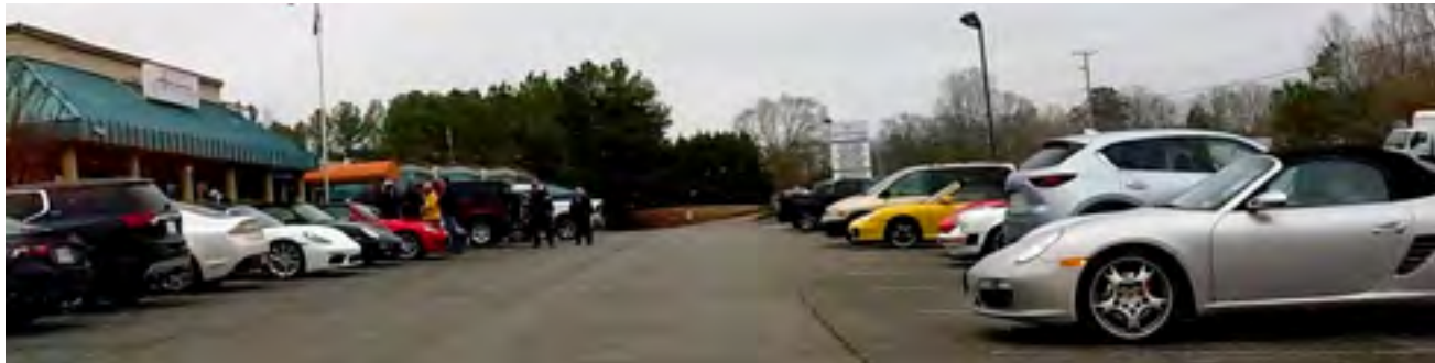
Arriving at Old Oak Cafe to see several Porsches already there.