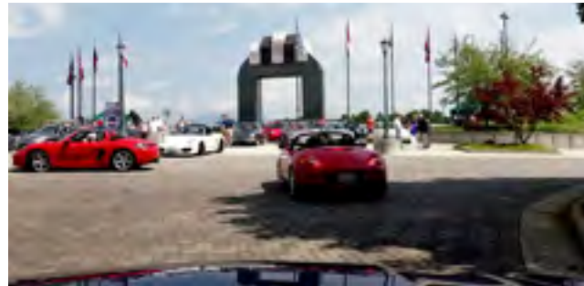
Porsches arriving at The National D-Day Memorial in Bedford, Virginia.