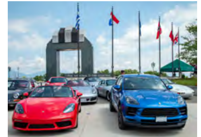
This Macan was only "grocery getter" in the group.