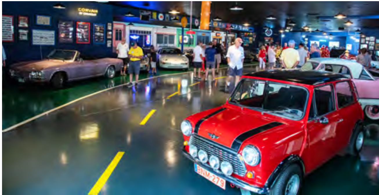
We enjoyed visiting a private collection and seeing some rare and unusual vehicles.