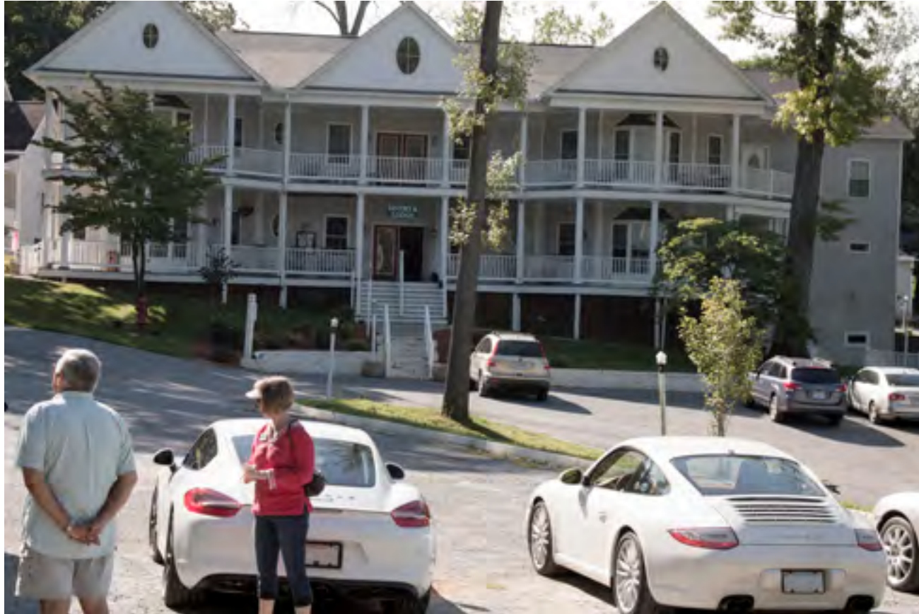
Cars 'n Coffee at Acorn Hill Lodge in Lynchburg, VA. 2017