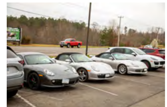
Four member cars at Old Oak Cafe. The earlier rain sprinkles went away so everyone had a dry drive home. Unfortunately, it was a little too cool to have the top down.