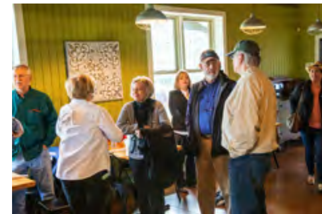
Inside the restaurant, the smells of food made everyone ready to eat.