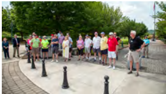
Blue Ridge Region Members at The National D-Day memorial for the donation presentation to the Bedford Boys Tribute Center.