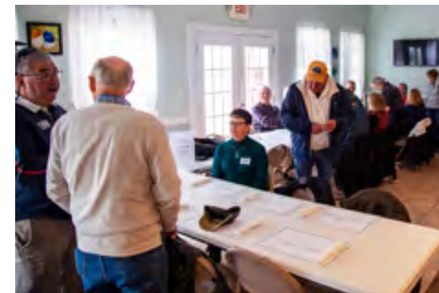
Our friendly group enjoyed the food and company.

Our first Cars 'n Coffee this year was in February at Acorn Hill Lodge in Lynchburg, VA. After a winter break from club events, everyone was anxious to get together again.