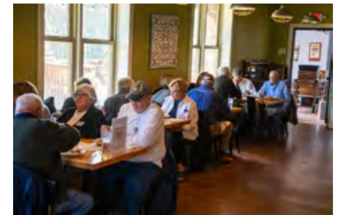
The buffet had something for everyone. It was obvious everyone was enjoying the food and drink.