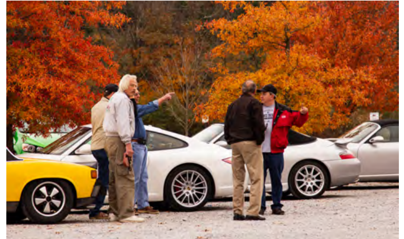
Blue Ridge Region members at the Swinging Bridge Restaurant in Paint Bank, VA. 2015