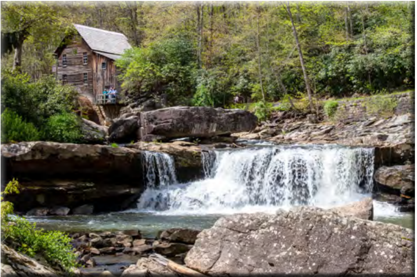
Grist mill and stream in West Virginia. Can you see who is standing at the mill?