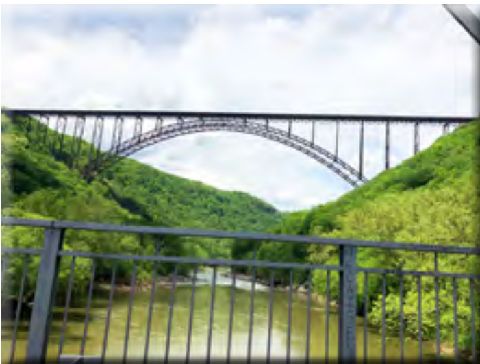
The New River Gorge bridge from below.