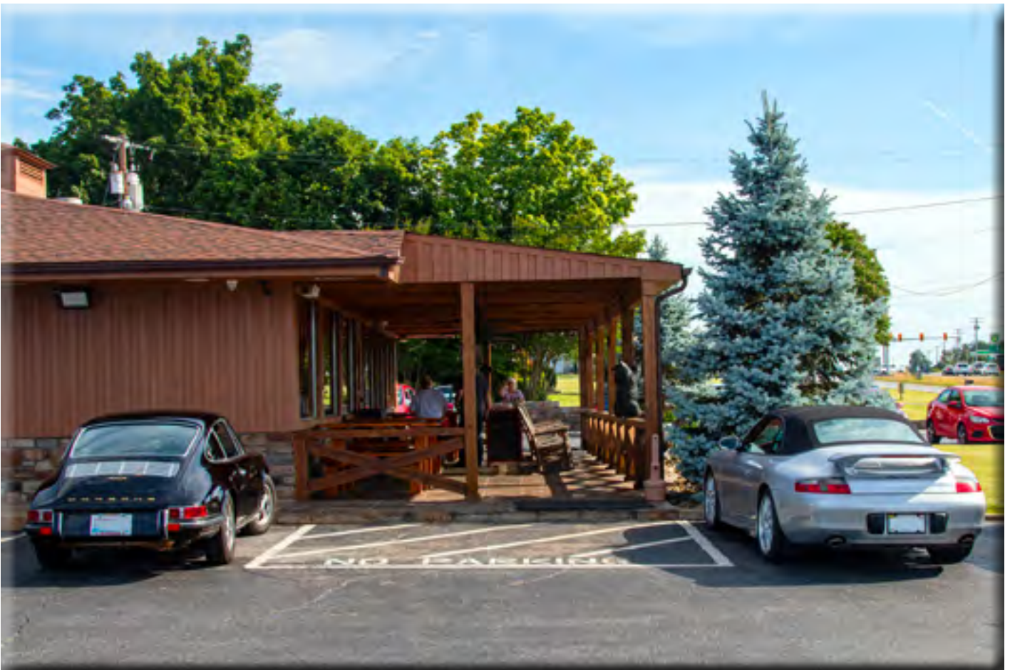
An early 911 and its newer sibling provide eye candy for people entering & leaving the restaurant.