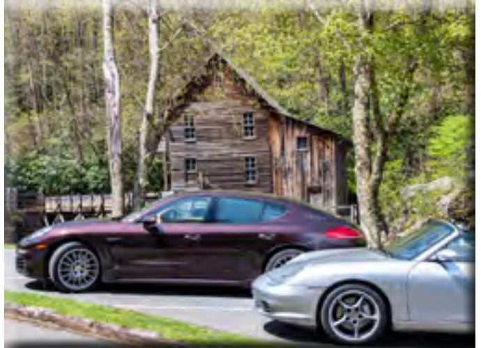
Grist mill at Babcock State Park.