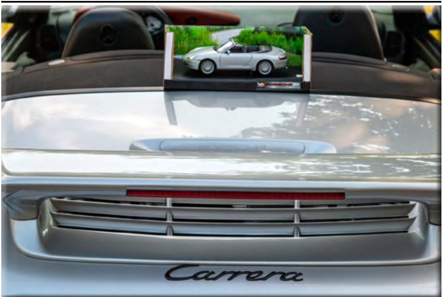
This 911 brought its smaller brother to the cruise-in.