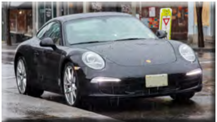
Our first Cars 'n Coffee of 2019 was held in rain & snow weather.