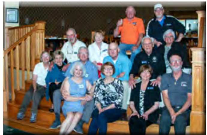
Part of our group at Glade Springs Resort.