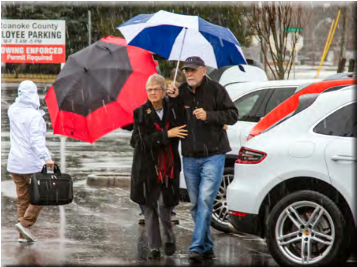
Blue Ridge Region members do not let a little wet weather keep them from good food and a friendly meeting.