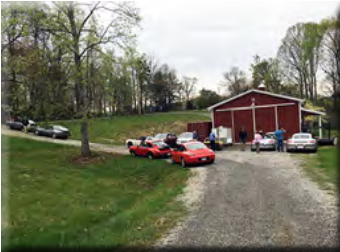
After Cars 'n Coffee, a stop at Mark's nearby garage.

atmosphere and specialty. Not only are these brunches an excellent social opportunity, but a chance to learn more good places to dine. Many locations offer other things to do after eating. So drive your Porsche and join us. Casual is the word and good friends are there with you. Dates & places are on our website and Facebook page, and in Monday Morning Porsche Piddlings.