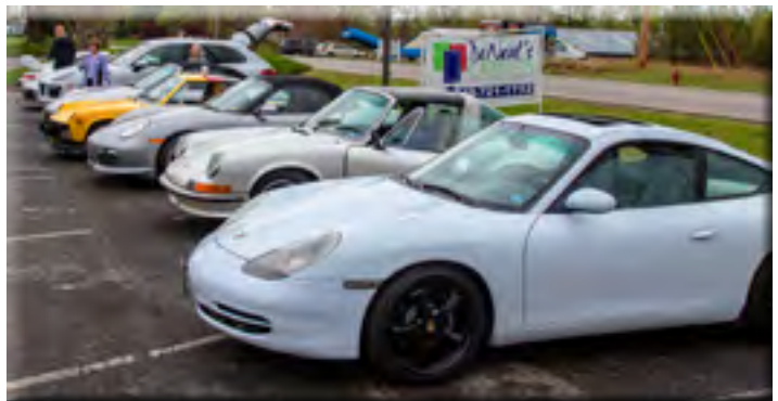
Some of our cars at Old Oak Cafe.