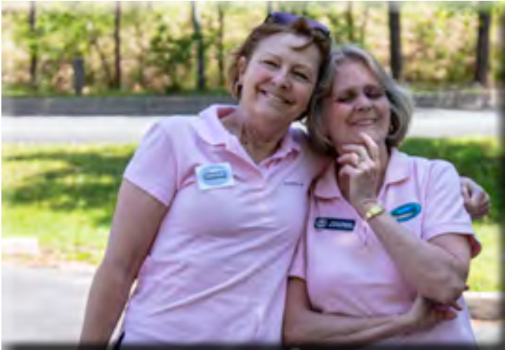
We got the dress code. Did you miss the memo?