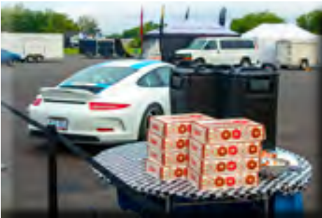
An early morning start with Porsche, doughnuts, and coffee at Virginia International Raceway. That is a great way to start the day!

allowed on the track for parade laps. Some said the speed on the track was too slow. But whatever the speed, parade laps are fun. Join us in 2019.