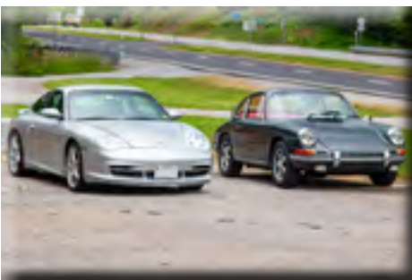
Something new and something old. A lot of changes have been made over the years.