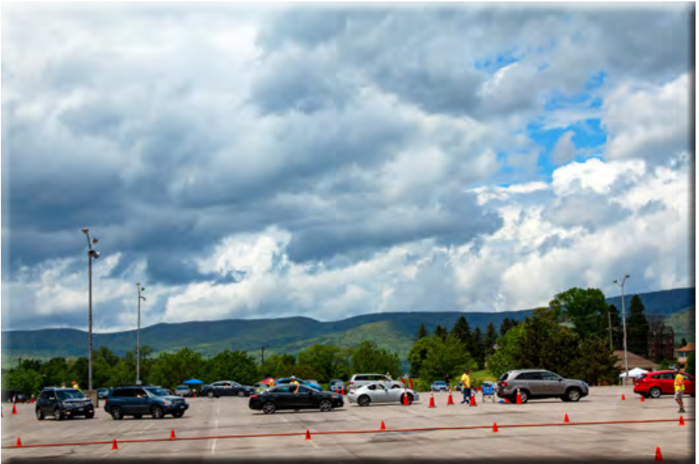
The Blue Ridge Mountains gave our region its name and provide beautiful scenery.