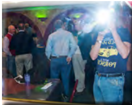
Reflecting on the previous year and anticipating the current year at the January planning session.