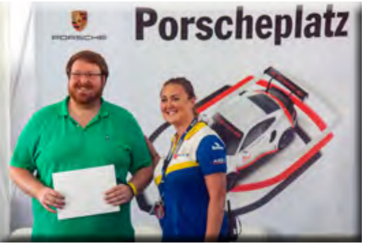
Hi everyone! We are at Hot Shots for food and golf. I won a set of Michelin tires at the VIR Porscheplatz.