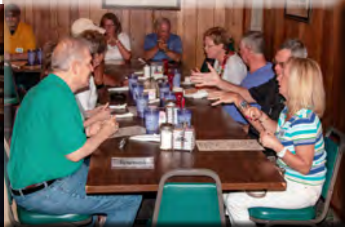
We intercepted NC invaders at Chateau Morrisette. Good conversation while waiting for food at Hale's.