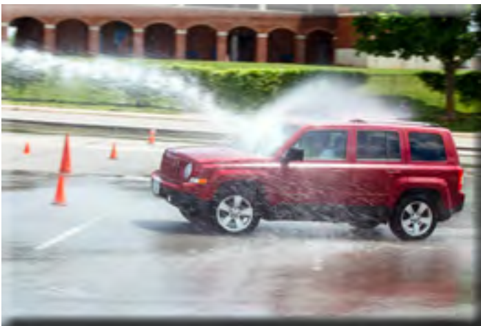
Driving on wet pavement and in heavy rain creates several driving hazards. This driver receives a heavy water blast to the windshield, much like a passing truck may send.

Thank you to the Salem Civic Center and Salem Fire Department, and our many dedicated volunteers.