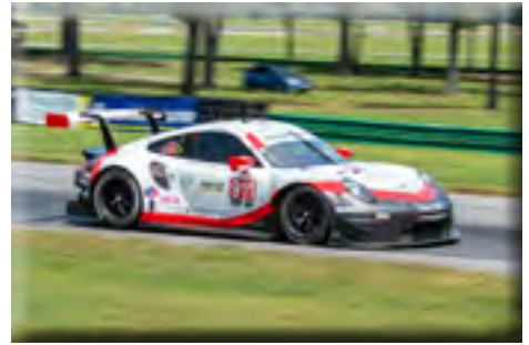
Porsche #911 on the track at Virginia International Raceway. Along with the sister car #912 their distinctive exhaust note means fans can hear them coming.