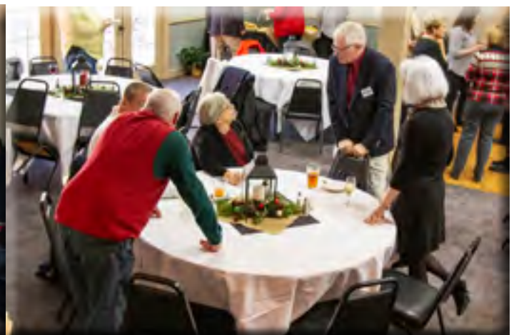
Menu choices come first at Old Oak Cafe. December Holiday Party at Westlake Country Club.