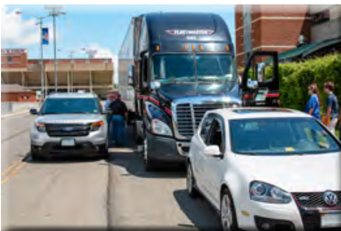
Do you wonder what a big rig driver can see when your car is near? Students got into the driver seat with cars around them as in typical traffic. Another driving hazard to be recognized in everyday driving.