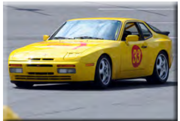
Another view of our new president in this 2010 photo.