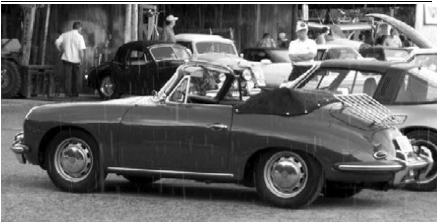
A rogue shower also “spotted” this 356 C. The sun quickly returned.